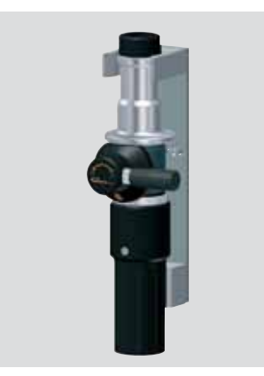
TK16 CNG with mounting